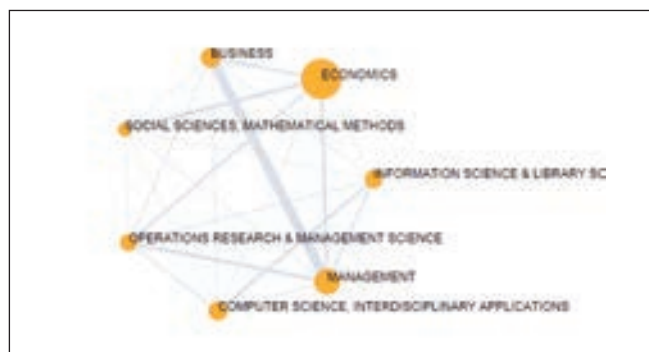
Figure 4: Personal Node Map