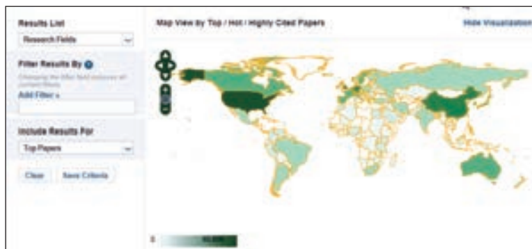
Figure 7. Map View of Highly Cited Papers by Topic for Mainland China