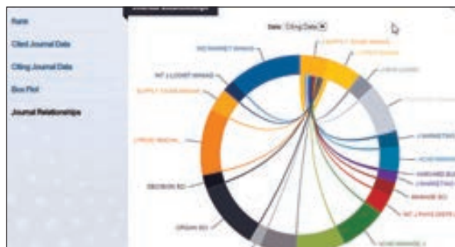
Figure 2: Map of Journal Relationships by Citing Data