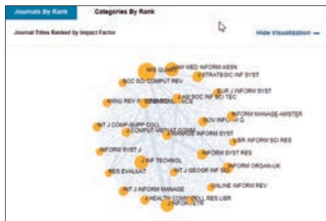
Figure 5. Journal titles in Information & Library Science Ranked by Impact Factor