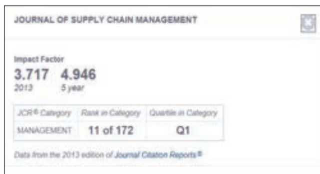
Figure 1. JCR information in WoS records for subscribers to the new platform

Upgrades to JCR include visualization of relationships among key topic areas and relationships among journals, expanded years of data, limiting capabilities, improved graphing, and downloading. You can create rankings by category or by journal. The default image is a “node map,” showing the top categories by number of journals out of 232 categories. A list of all categories follows. (See Figure 3 below.) Because the