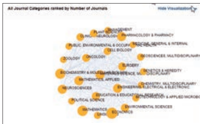
Figure 3. Node Map of Journal Categories ranked by Number of Journals (included in SCI and SSCI)